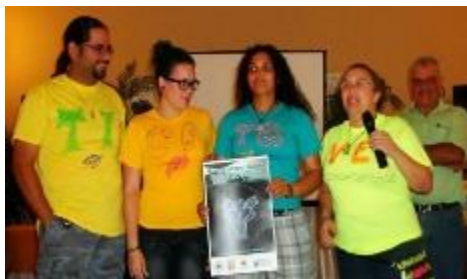
TICATOVE accepting the 2do Encuentro de Grupos Tortugueros de Puerto Rico poster and accepting to be the hosts on the next meeting.