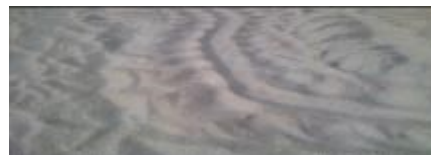
Leatherback track left on the beach on her visit to nest.