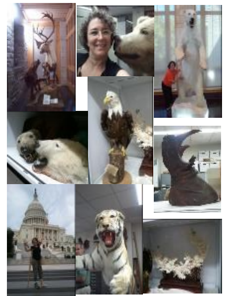
Above pictures: you can see some animals and animal parts that are protected and are part of the illegal wildlife trade. These items have been impounded by the USFWS and now are used for educational purposes.