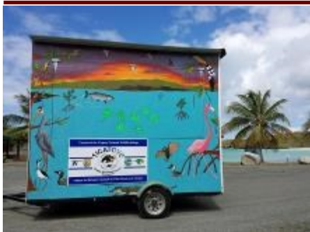
Members of TICATOVE of all ages (from 3 years old to 70 years old) helped

painting and decorating TICATOVE's kiosk. It represents Vieques wildlife, natural areas and it's waters. This kiosk is a point of contact for the visitors, an extension of the gift shop and an area for education and environmental interpretation. It's being open only during the weekends on Caracas Beach.