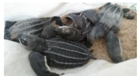
Leatherback hatchlings that were rescued from a hatched nest.