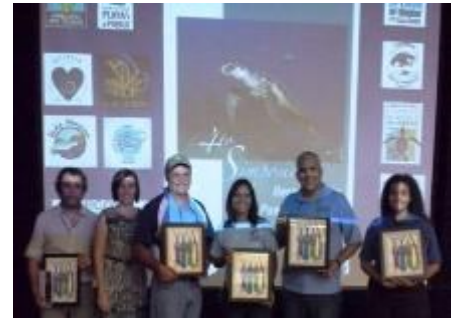
Here we see representatives from the groups ATMAR, Yo Amo El Tinglar, Chelonia Dorado and TICATOVE.