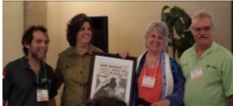
DNER Secretary was present on the opening of the WIDECAST annual meeting

er agencies, this work contributed to the efforts being done by WIDECAST and to the conservation of sea turtles in the Caribbean. Aside from the meeting and the presentation, there was also a poster session for the sea turtle groups to present.