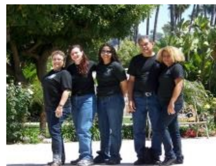
Picture of the group that assisted to the 31 st International Sea Turtle Symposium held in California.

during his presentation highlighted the importance of a community based organization like TICATOVE for the conservation of sea turtles.